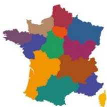
13 Regions of France