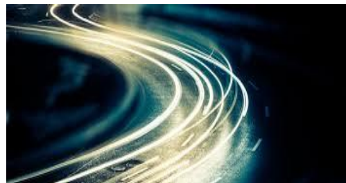
Electric Highway Civil Engineers