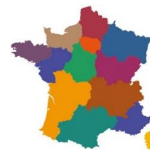
13 Regions of France