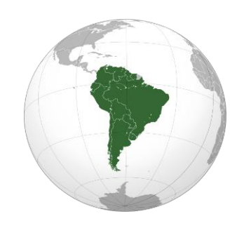
South American Countries